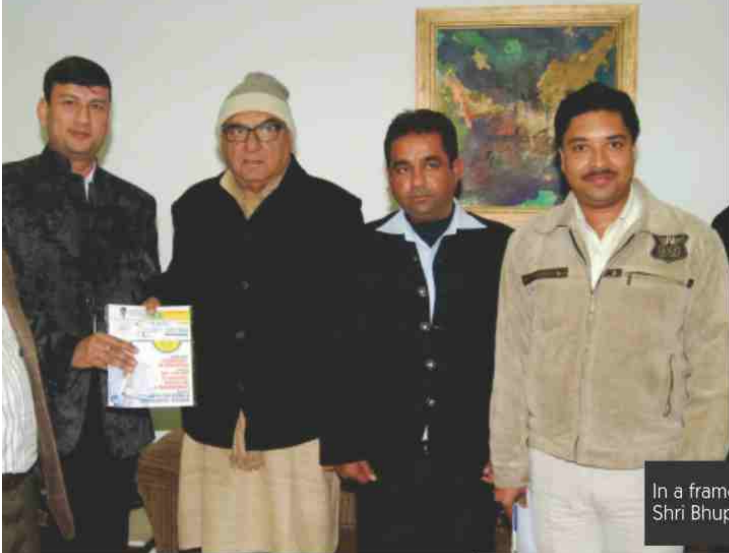
In a frame with the Chief Minister of Haryana, Shri Bhupender Singh Hudda

Possible career paths : Counselor, salesperson, politician and businessperson.